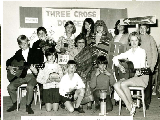
Young Sower League rally in 1969