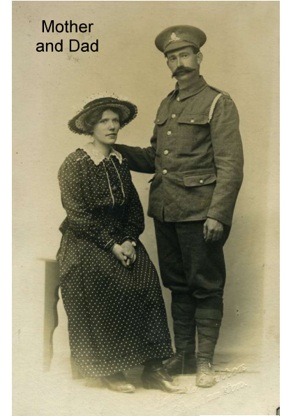
Mother and Dad