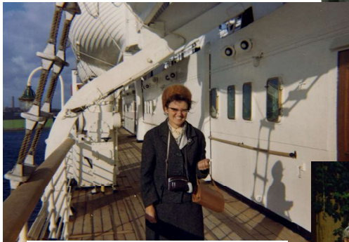
On "Caledonia" leaving Liverpool.

Hostel, then a few months later a fire burned the thatched roof. The calamity proved a blessing in disguise as Tear Fund donated a large sum and others gave gifts so a new building of brick and cement could be built. Over the years other buildings have been added.