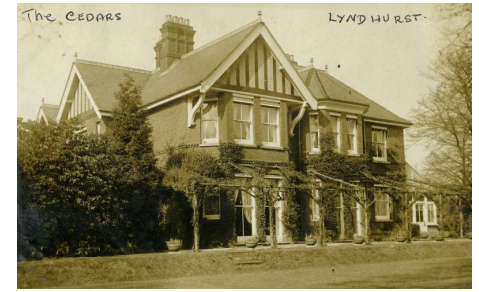
The Cedars in Lyndhurst