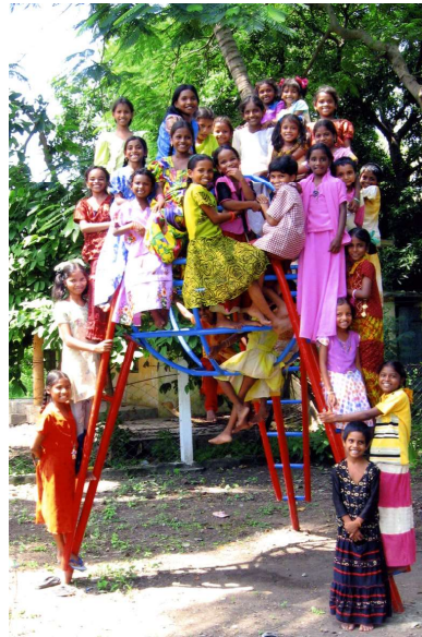
Children on the 'Globe' at Bowden Park.

The family would like to say a big thank you to all those who have helped her during her time in India.